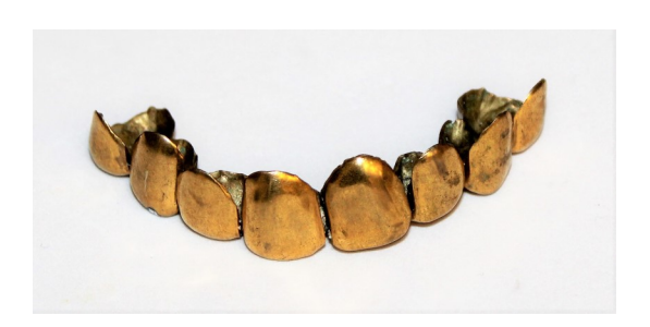
Best Unusual Miguel Rodriguez